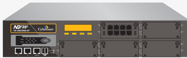
Flexi Ports Module